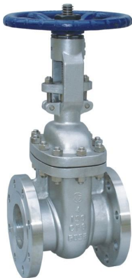
Cast Stainless Steel Gate valve ZZ-001