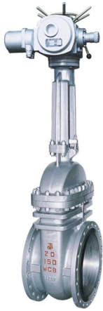
Cast Stainless Steel Gate valve ZZ-012