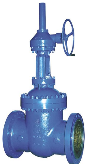
Cast Stainless Steel Gate valve ZZ-010