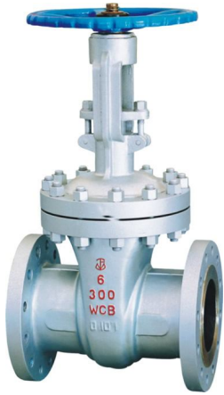
Cast Stainless Steel Gate valve ZZ-011