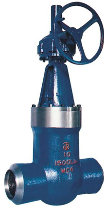
Cast Stainless Steel Gate valve ZZ-009