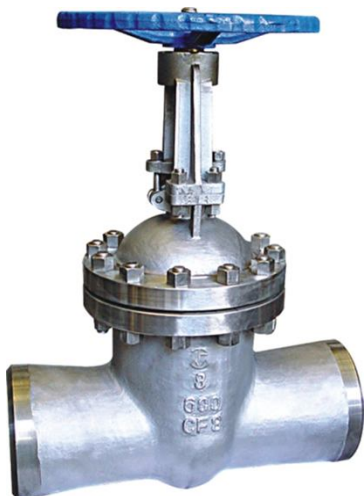
Cast Stainless Steel Gate valve ZZ-008