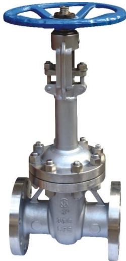
Cast Stainless Steel Gate valve ZZ-007