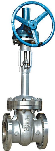
Cast Stainless Steel Gate valve ZZ-013