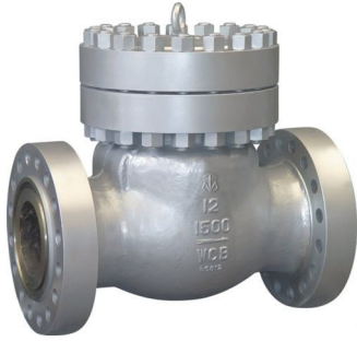
Cast Steel Check valve ZH-005