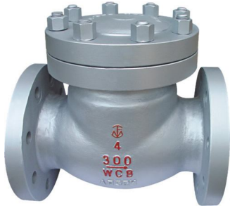
Cast Steel Check valve ZH-004