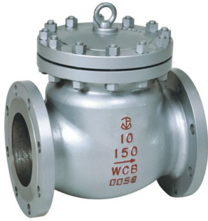
Steel Check Valve Standards ZH-001