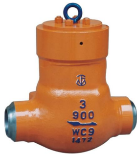
Steel Check Valve Check valve ZH-006